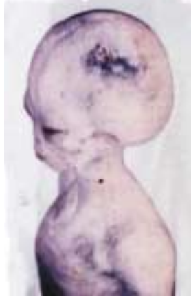
Alien Found in China. (Left side)