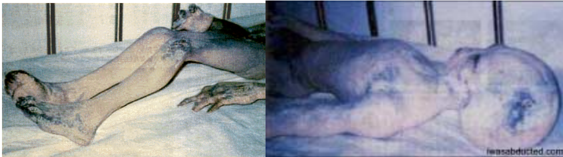
Same Alien from China. (Laying down)