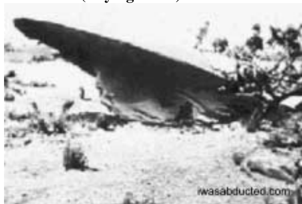
Alien wreckage in Roswell.