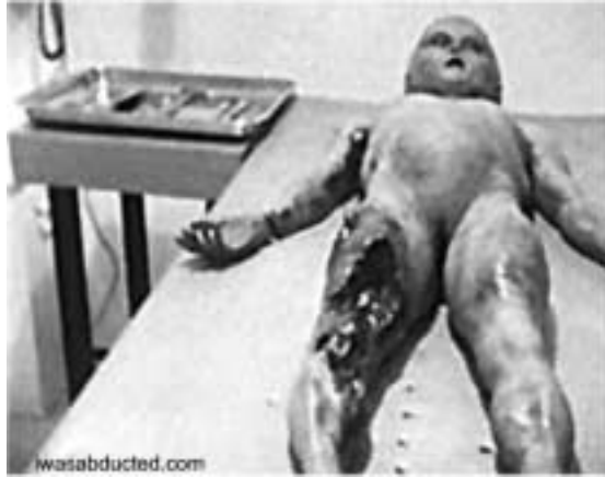
Alien Autopsy after Rosewell incident.