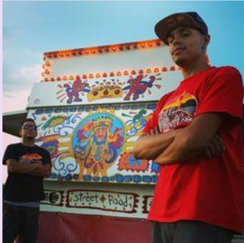
Street Food Blvd.

(Teachers grab a boxed lunch outside the auditorium.)